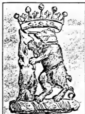
NEVILLE FAMILY CREST.